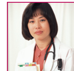
Earn ACPE-Approved Certificate!

Do you already have advanced knowledge in pharmacokinetics and are only looking for the ACPE-Accredited Certificate? If so, you have the option to register for the course's certificate program (15 contact hours). You have up to three months to complete this program. The Certificate of Mastery is intended for practicing pharmacists and requires demonstration of competence in clinical pharmacokinetics in an actual patient care setting. You must be a licensed pharmacist, and you must have access to patient care during the duration of the course. Go to the course Web site for more details.